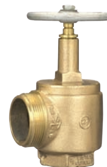
female x male 18-157