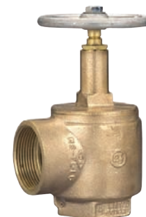
female x female 18-158