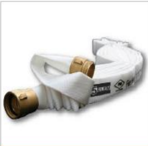
Rack Hose-FBX Series

A single jacket 100% filament polyester hose intended for interior protection and occupant use in buildings and plants. Rack Hose-FBX is lined with thermoplastic polyurethane (TPU). Light-weight and compact. FBX rack hose has a service test pressure rating of 150 Psig (1035kpa) and 250 Psig (1750 kpa) and is approximately half the weight of conventional rubber lined single jacket hose.